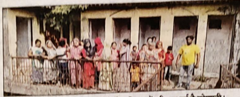
शौचालय में दरवाजे नहीं होने से महिलाओं की बढ़ गई है परेशानी।

वसई विहार मनपा क्षेत्र में स्वच्छ भारत अभियान दम तोड़ता नजर आ रहा है। वसई पूर्व में स्थित जय संत जलाराम बापू नगर की चौक के हजारों लोगों को शौचालय के लिए पैसे चुकाने पड़ते हैं। पांच हजार की आबादी वाले इस क्षेत्र में मनपा द्वारा बनाया गया सार्वजनिक शौचालय बर्दाहल स्थिति में है। शौचालयों के दरवाजे तक गायब हो गए हैं। महिलाओं को शौचालय तक इस्तेमाल करने के लिए पैसे देने पड़ते हैं। जानकारी के अनुसार, इस इलाके में